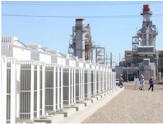
Imperial Irrigation District (IID) 30MW/20MWh BESS project